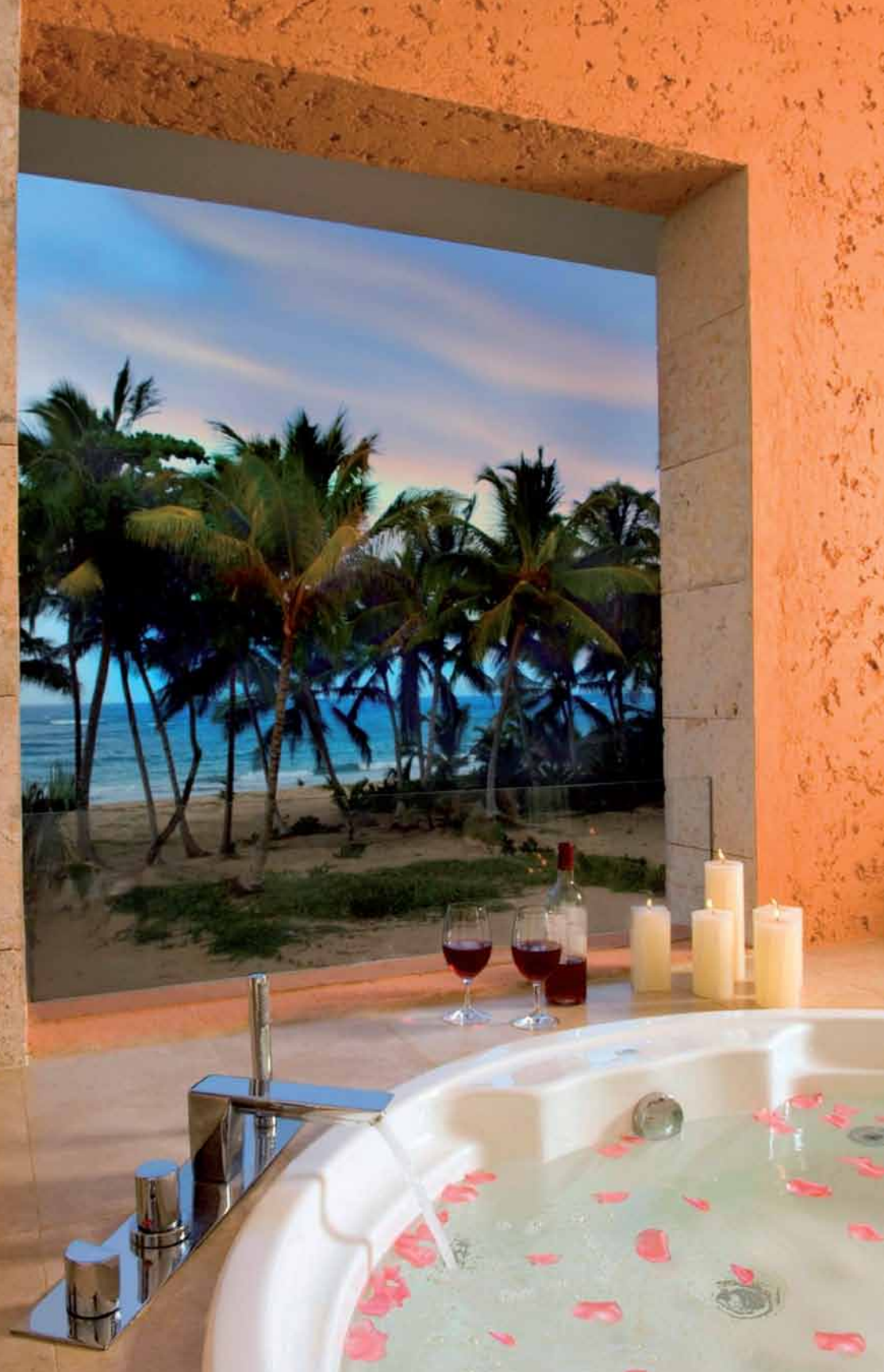
Honeymoon Suite, jacuzzi on terrace