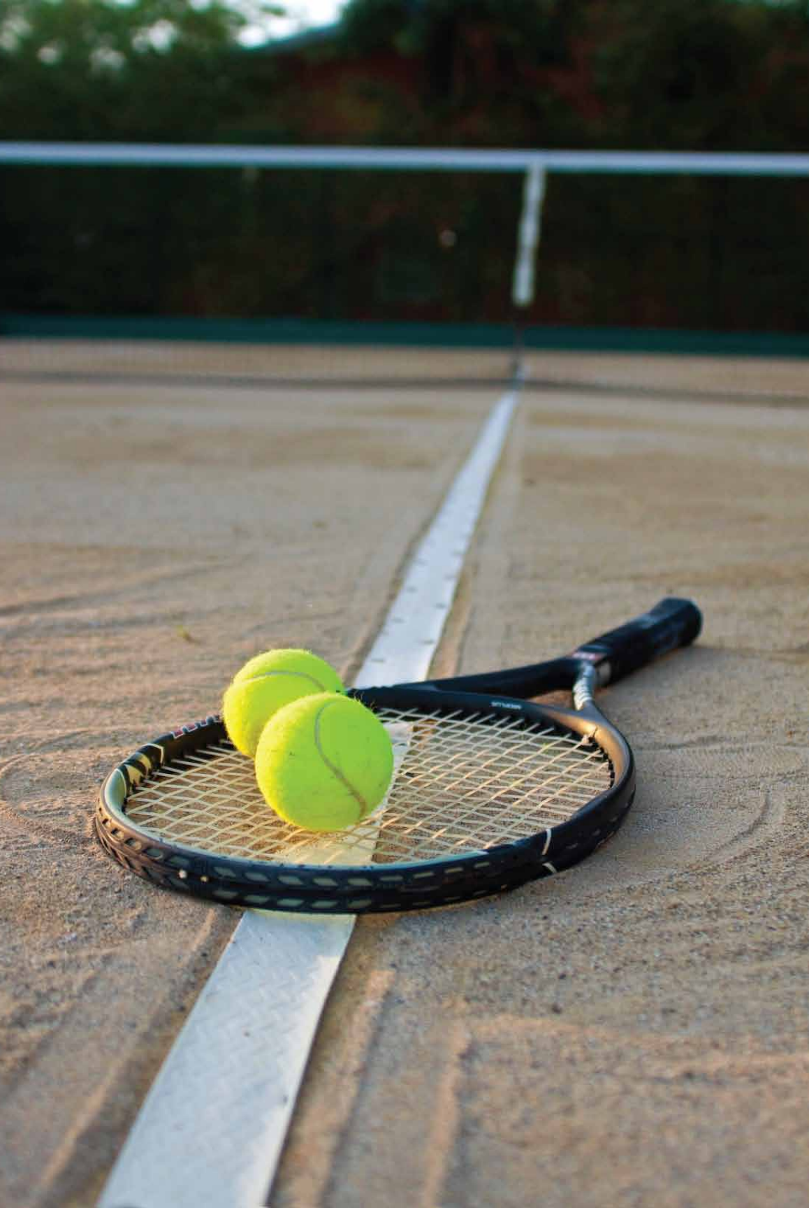
1. Tennis court